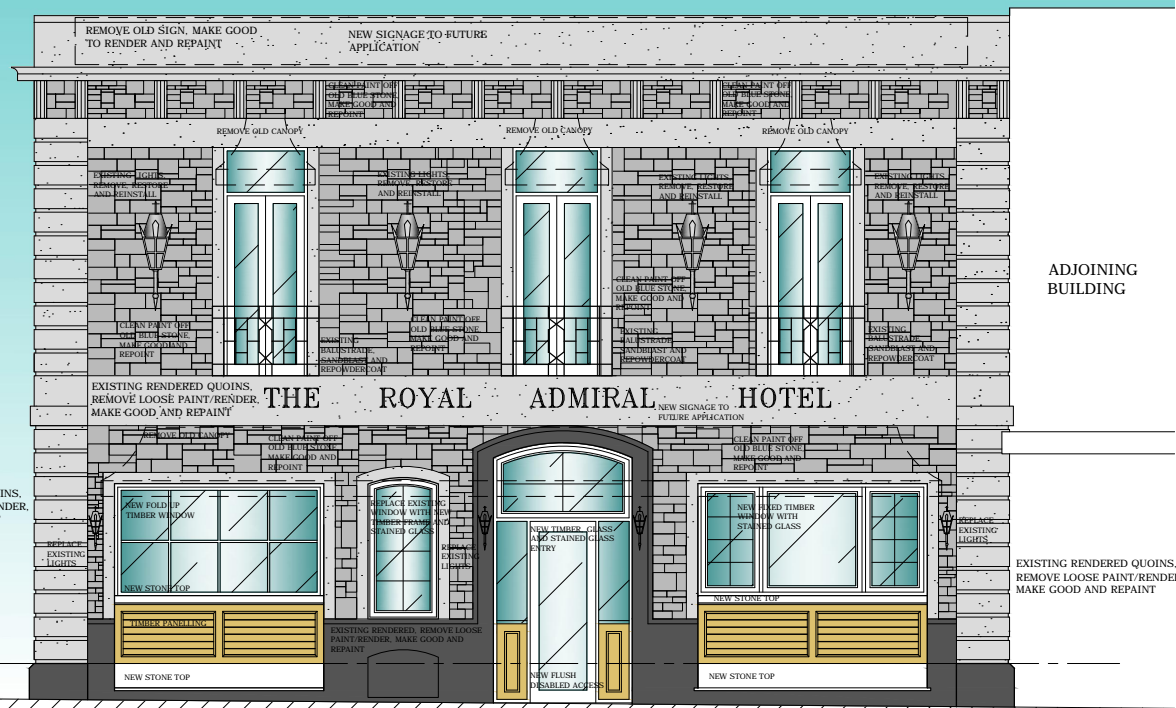
NORTH ELEVATION FACING HINDLEY STREET SCALE 1:50